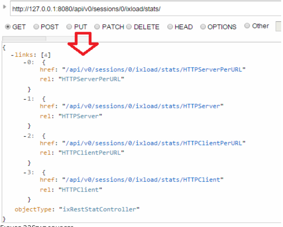
FIGURE 22STAT SOURCES

When a repository is loaded that contains L47 protocols, a GET request on this URL will return a list of stat sources, as seen below in Figure 22.