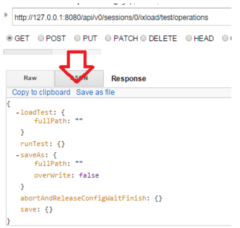
FIGURE 5 OERATIONS GET

Figure 5 shows how the operations available for the test REST resource are represented.