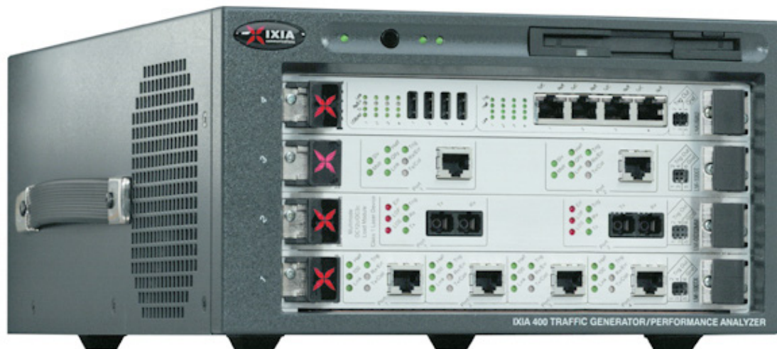
Figure 11-1. Ixia 400T Chassis

Note: The Ixia 400T must only be operated in the horizontal position as shown in Figure 11-1 .