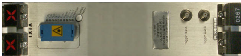
Figure 26-2. LMOC192c Load Module

mode, as opposed to channelized mode. One of the modules in this family (the LMOC192cPOS) is shown in Figure 26-2 .